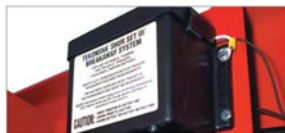
All Mac-Lander trailers are equipped with conduit enclosed wiring loom and safety break-away kit with battery.