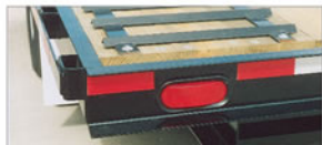
DO Series equipped with protected and recessed tail lights.