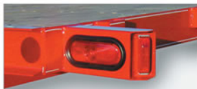
All tag-alongs equipped with reliable sealed beam tail lights.