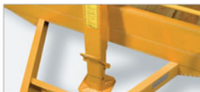
FH and SL Series equipped with heavy duty spring assist jack.