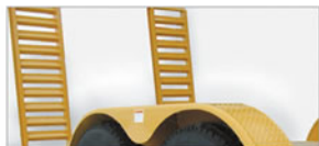
FM, FH & SL Series equipped with "Roughneck" diamond plated fenders.