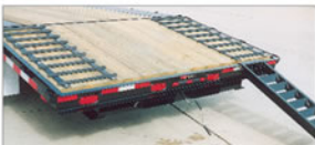
E-Z Crank Beavertail.